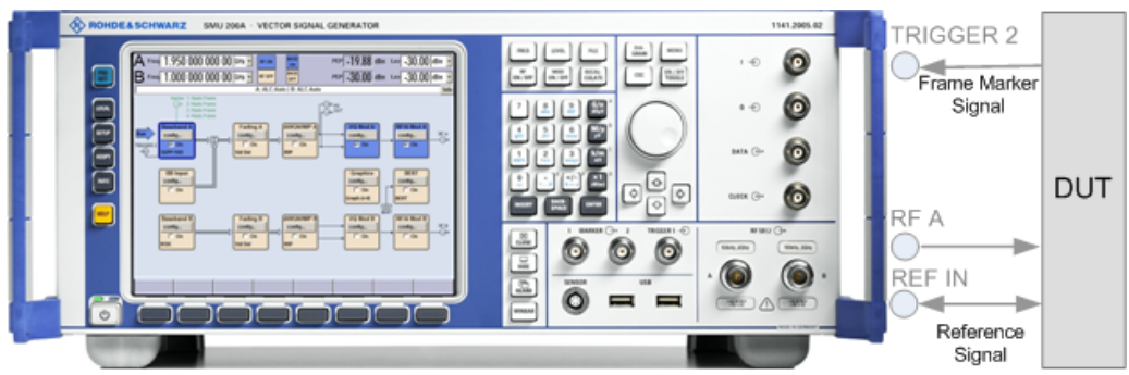
Fig. 1-1: Test Setup (example with R&S SMU)